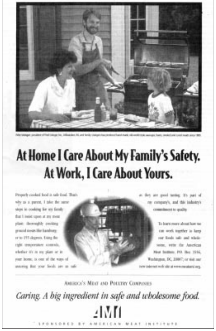
If the meat industry has its way, your information about food safety issues will be limited to self-serving propaganda like this ad.

The United States legal system has historically placed a high value on freedom of speech. The First Amendment states that "Congress shall make no law...abridging the freedom of speech, or of the press; or the right of the people peaceably to assemble, and to petition the Government for a redress of grievances."