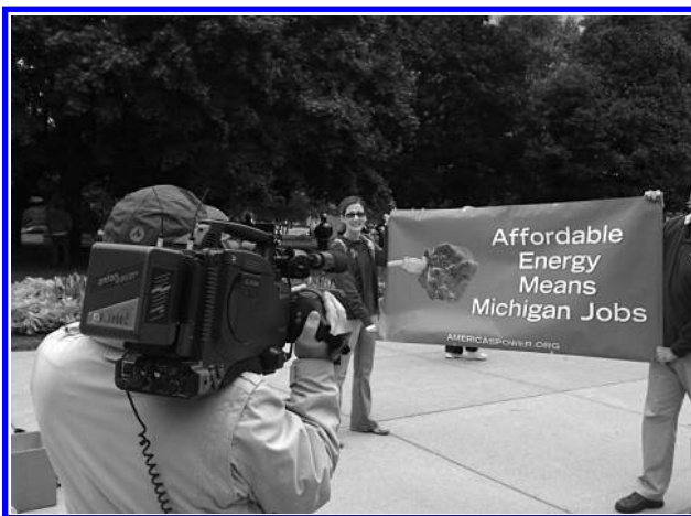
Reporters cover a “clean coal” rally at the Michigan State Capitol.

These realities must be tempered by the understanding that much of our civic landscape remains unchanged. Even though it's tempting to conclude that face-to-face recruitment into political activity has been replaced by televised advocacy